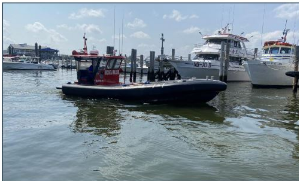
Miller's Crew Boat

Fisheries questions and concerns please contact: